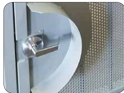
LockGuard™ with leverset hardware