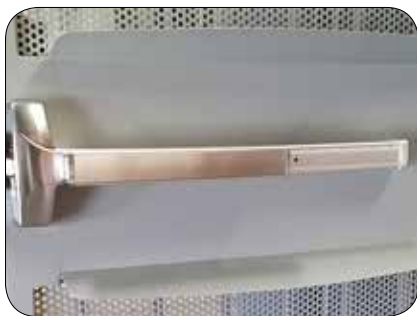
BarGuard™ with Panic Hardware