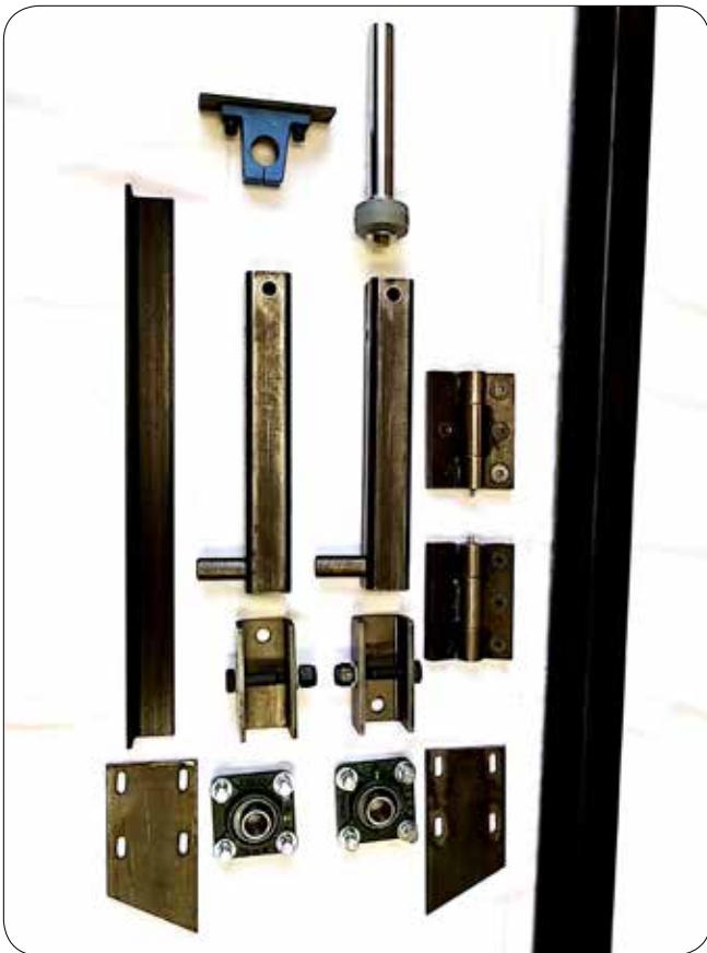
Part # QFPM.001R