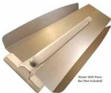
BarGuard™ with Panic Hardware