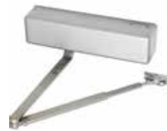
- Or - Hydraulic Closer